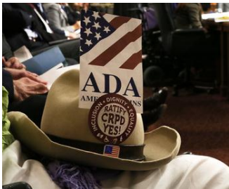
ADA leader Justin Dart's hat in his honor at CRPD Senate hearing