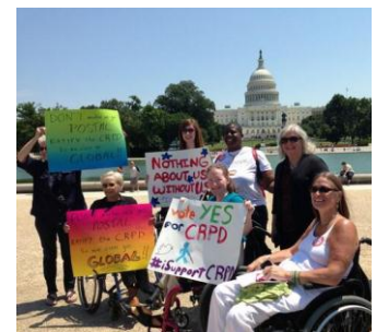
Advocates for CRPD rally on Capitol Hill for bipartisan support