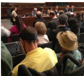
Attendee uses U.S. innovation to participate in CRPD briefing by American business leaders