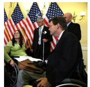
VSO Press Conference on CRPD